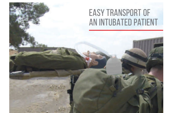
EASY TRANSPORT OF AN INTUBATED PATIENT